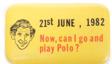
A polo pin badge featuring H.R.H. Prince Charles The Prince of Wales Est: £100-150