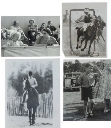
Four original black & white press photographs featuring the Royal Family Est: £120-180

Graham Budd Auctions, the leading sports memorabilia auctioneer in the U.K., will be holding a unique auction devoted to all aspects of Polo to coincide with the 150 th anniversary of the first Polo game played in England. The timed internet auction (on the-saleroom.com) will take place in the middle of the UK Polo season between Saturday, June 29, and ending on the evening of Monday, July 15, 2019 . Entries for the auction will be accepted until May 31, 2019.