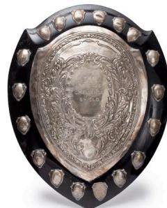
A fine polo trophy for The Pringle Challenge Shield competed for between 1922 and 1939 at the Goriajan Club on the Koomtai Tea Estate, Assam, India Est: £600-800