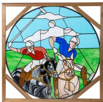
A leaded and stained glass window panel featuring two polo players. British, 20th century Est: £1,000-1,500