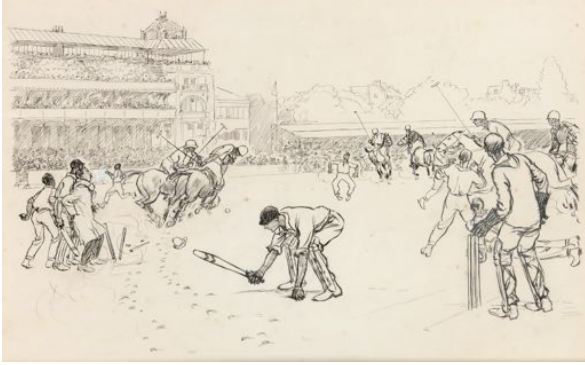
An original pen & ink cartoon by Ernest Howard Shepard, Est: £800-1,200