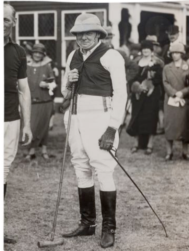
Winston Churchill playing in a match on behalf of the House of Commons Est: £150-200

Graham Budd Auctions, the leading sports memorabilia auctioneer in the U.K., will be holding a unique auction devoted to all aspects of Polo to coincide with the 150 th anniversary of the first Polo game played in England. The timed internet auction (on the-saleroom.com) will take place in the middle of the UK Polo season between Saturday, June 29, and ending on the evening of Monday, July 15, 2019 . Entries for the auction will be accepted until May 31, 2019.